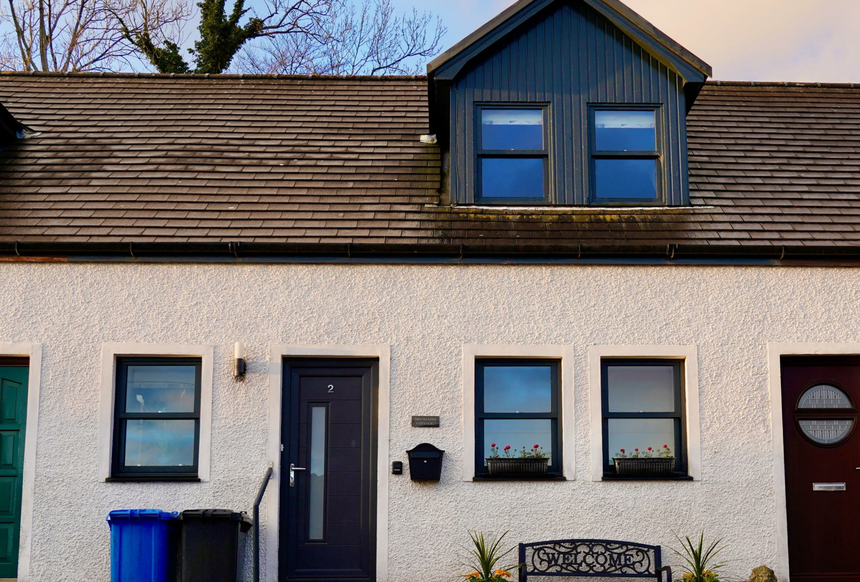
2 Mid Mayish Cottage, Brodick, Isle of Arran KA27 8BX